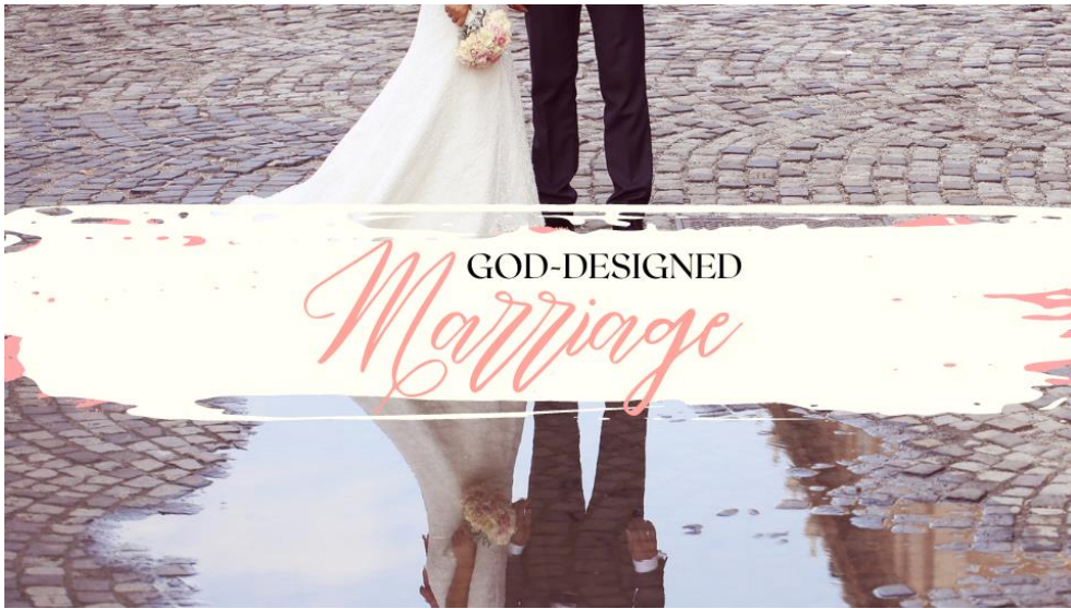
The Canvas: What picture is your marriage painting?