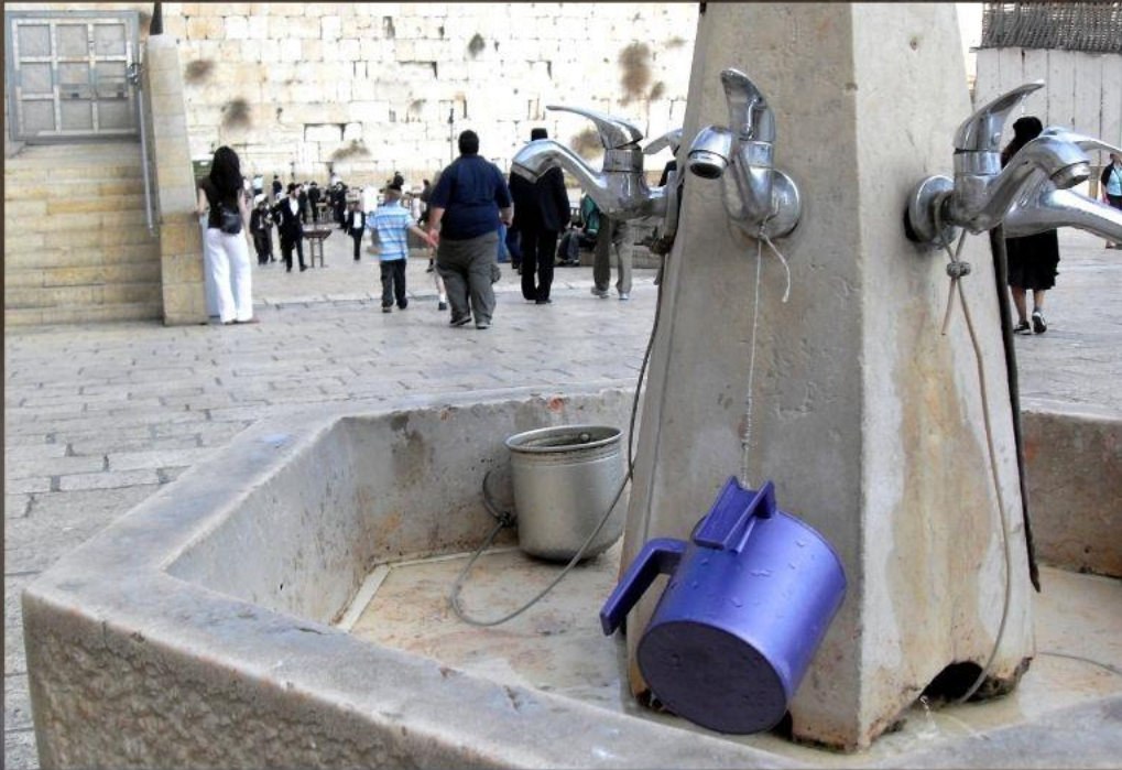
Hand washing station at the Western Wall